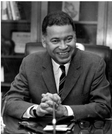
Senator Edward William Brooke, III Massachusetts (R) 1967-1979

Did you know the Fair Housing Act of 1968 was a bipartisan effort to combat housing discrimination? Identify the two U.S. Senators—one Republican and one Democrat—who introduced this landmark legislation before Congress. (This was a tricky question. Hope you did your online research).