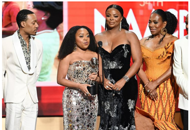
2024 NAACP Image Award Winner for Outstanding Comedy Series: Abbott Elementary

View the 2025 awards ceremony – SAT, FEB 22, CBS/BET