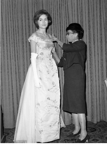
ANN LOWE during a dress fitting. More About Ann Lowe and Her Dress Designs

Where did Martin Luther King, Jr. deliver his famous “I Have a Dream” speech?