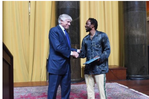
Kendrick Lamar accepts the 2018 Pulitzer Prize for Music from Columbia University President Lee Bollinger. More about Kendrick Lamar’s Pulitzer Prize Win