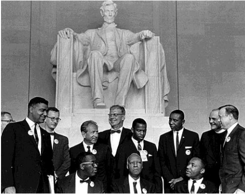
Martin Luther King Jr. (lower right) and other civil rights leaders gather before a rally at the Lincoln Memorial on Aug. 28, 1963, in Washington. More about Martin Luther King, Jr’s “I Have a Dream” Speech

This novel was a monumental bestseller and won the 1983 Pulitzer Prize for literature and a National Book Award and is currently a popular musical. Name the writer and the book.